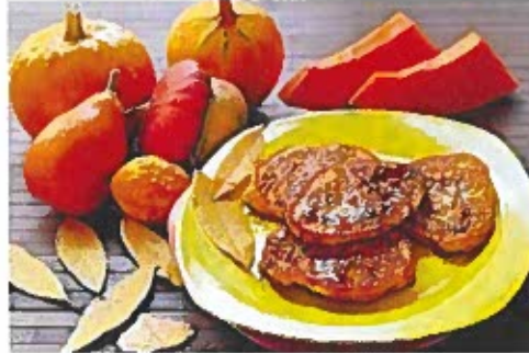
Photo: Pumpkin pancakes

Fall is in the air, and with it brings an abundance of squash. Embrace the fall season and these beautiful sweet gems in both savoury and sweet applications. Fall squash comes in many varieties including: pumpkin, acorn, butternut, spaghetti, and kabocha.