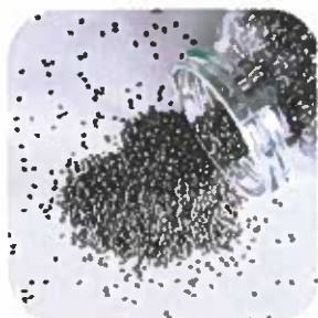
Chia seeds

Pulses are beans, lentils, and peas. Try adding chickpeas, lentils, black, navy or kidney beans to salads, soups, and pasta sauce.