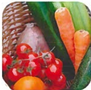
Vegetables and Fruits