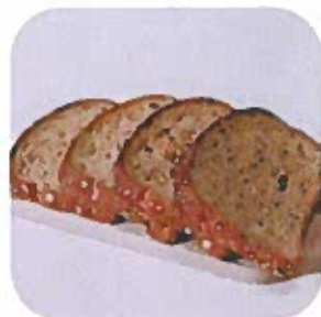
Whole grain bread

Follow Canada's Food Guide and make half of your plate vegetables and fruit. Check out the Eat More Vegetable and Fruits handout to learn more.