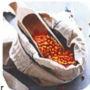
Red lentils

Choose whole grain breads, pastas and cereals, oats, quinoa, barley, bulgur, and brown rice. For more information check out the Choose Whole Grains handout.