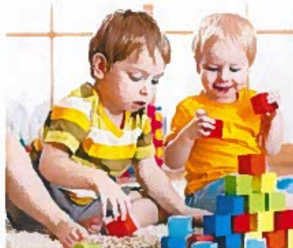
Language & Communication